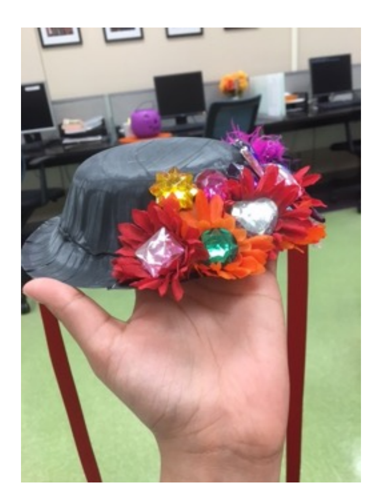
STEP 9: Take pictures & enjoy!