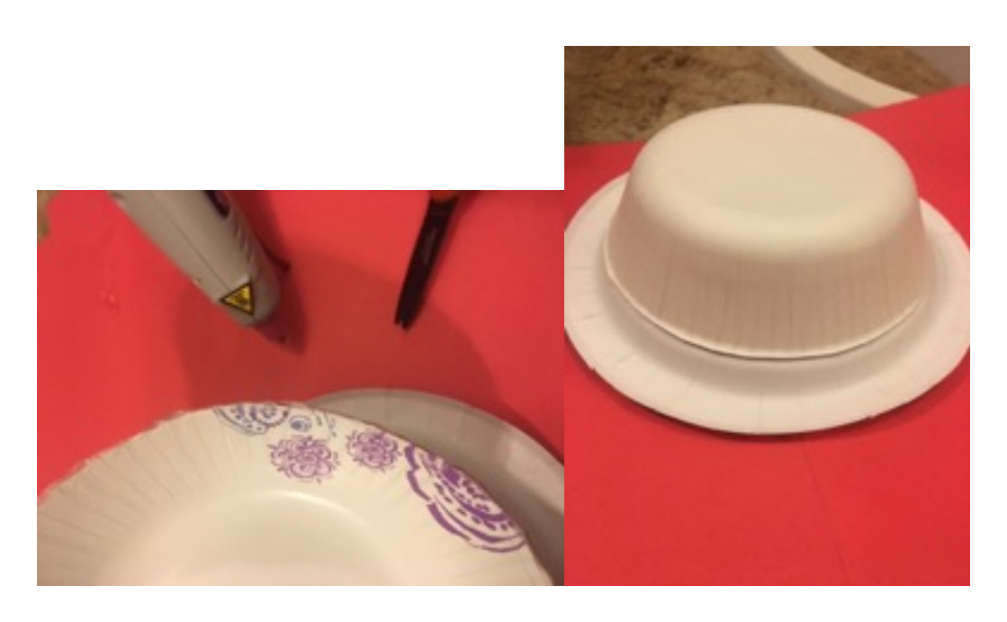
STEP 5: Color or paint paper plate and (I used black paint!)